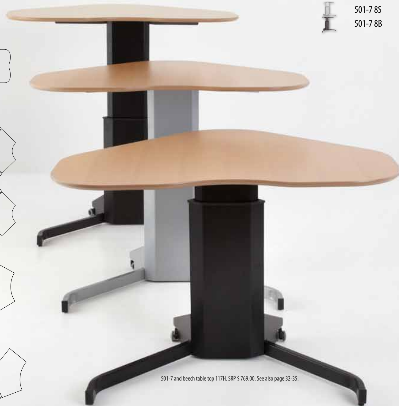
501-7 and beech table top 117H. SRP $ 769.00. See also page 32-35.