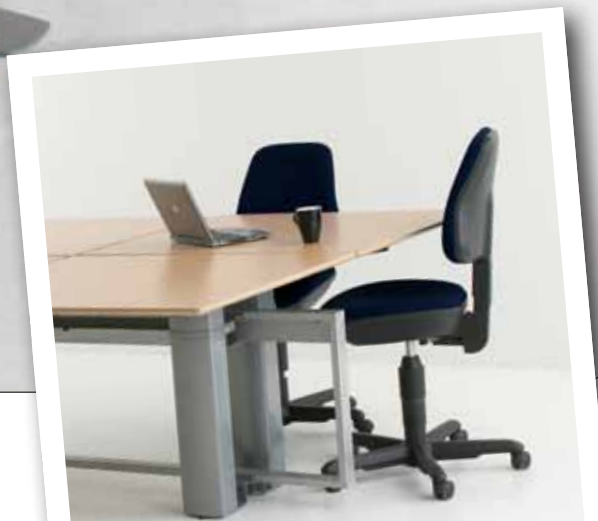
Modular frame with 4 501-19 columns and 4 beech table tops. 100-805. SRP $ 4,626.00. See also page 31-35.

The flexible little work station at the best price