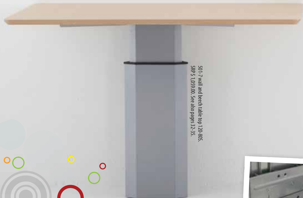
501-7 wall and beech table top 120-80S. SRP $ 1,059.00. See also pages 32-35.